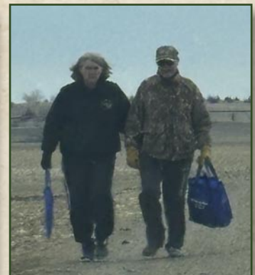
Mom and Dad walking back from the mail box