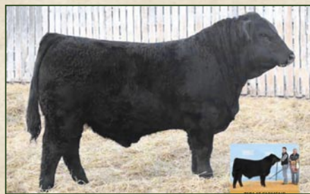
Black Gold Witness 210J