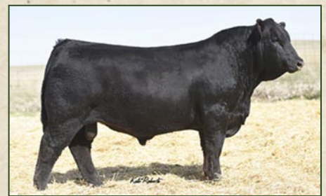
Colorado Bridle Bit E752