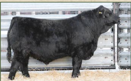
KWA Black Market 46J