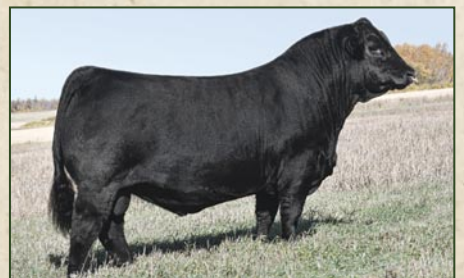
RF Caliber 014G